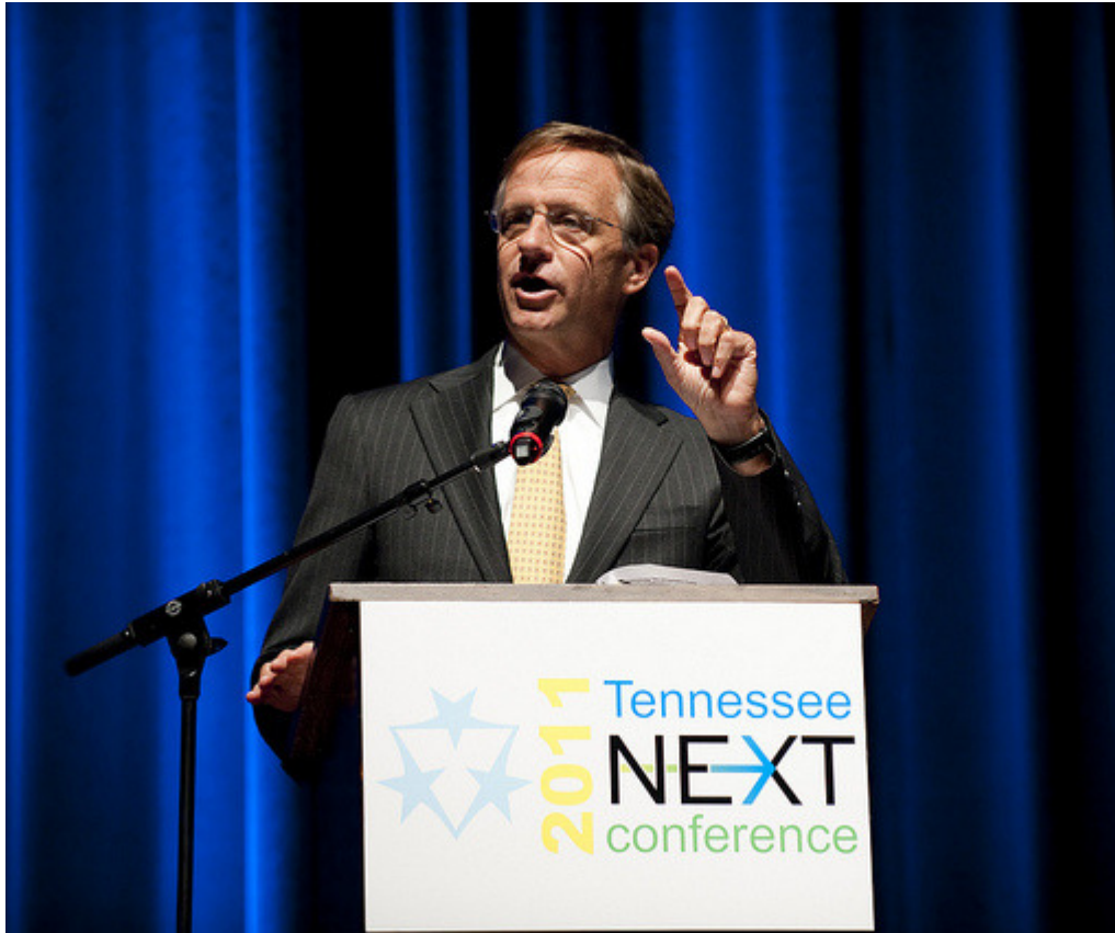
The Governor announced his INCITE Initiative on May 5, 2011 at the TTDC Annual Conference.